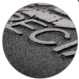
High Density Labels & Logos