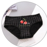
Other Specialty Items