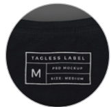
Tagless Neck Label

Now print on hoodies & a lot more with the all new standard pallets!