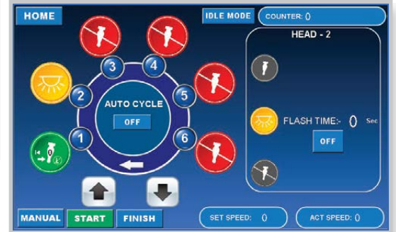
Digital touchscreen control panel loaded with a wide range of smart programs to assist operators in production